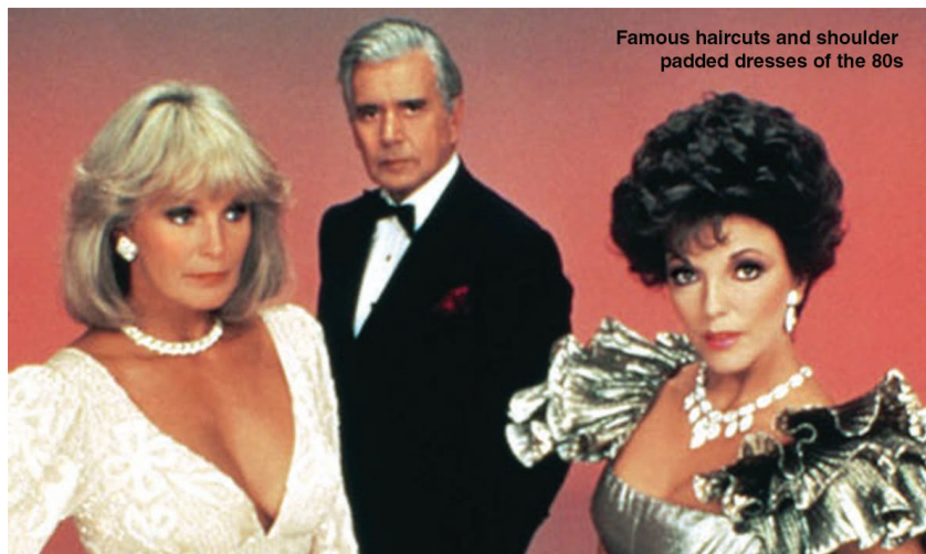
Famous haircuts and shoulder padded dresses of the 80s