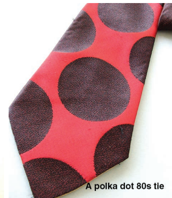
A polka dot 80s tie