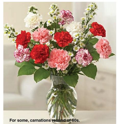
For some, carnations remind of 80s.

For starters, let's have a short trip down the memory lane and remember what the world was like the decade your family member/friend was born. What were the hottest songs and films back then? What clothes and accessories did everyone wear? What about the most popular foods, drinks and home décor elements? Bring those components to the party and re-create the atmosphere of that decade. The possibilities here are endless: you can play the 1980s songs, serve foods and drinks that used to be children (and not only) favorites, decorate your interior with elements that bring back the flavor of that decade, give your guests some of those once trendy accessories to wear during the party and so on. Whatever your choice, these elements are sure to trigger conversation and encourage the guests to share childhood stories.