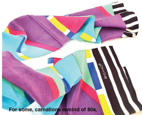
For some, carnations remind of 80s.

Upon arrival, the guests are welcomed with a cocktail that brings back the flavor of 1980s. Then, each guest is given or is allowed to pick a 1980s accessory to wear during the party. These might include scarves, ties, leg warmers or headbands, all of them in bright, bold colors. Also, 1980s are associated with Madonna-inspired large crucifix necklaces or brassieres (as seen in the video of the hit song “Like a Virgin”), Tom-Cruise inspired aviator sunglasses (remember “Top Gun”?), multicolored Swatch watches, slap bracelets, hefty bangles, etc. Another option would be the ultimate element of the 1980s style – the unforgettable shoulder pads. As for the background music, play some good old 1980s songs.